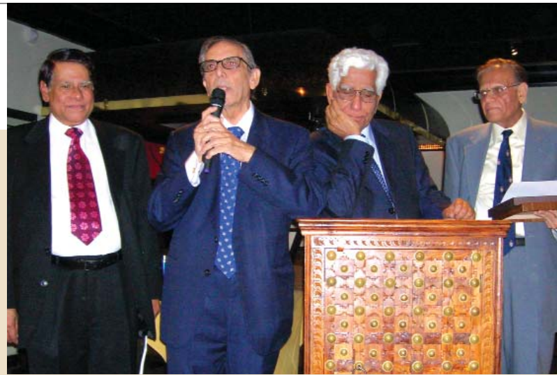
At Fundraising by SIUT North America, Houston